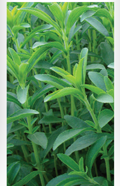
The cultivar behind ENLITEN® stevia contains very high levels of Rebaudioside A.